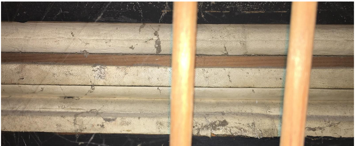
Above: original rib hinges with slight cracking