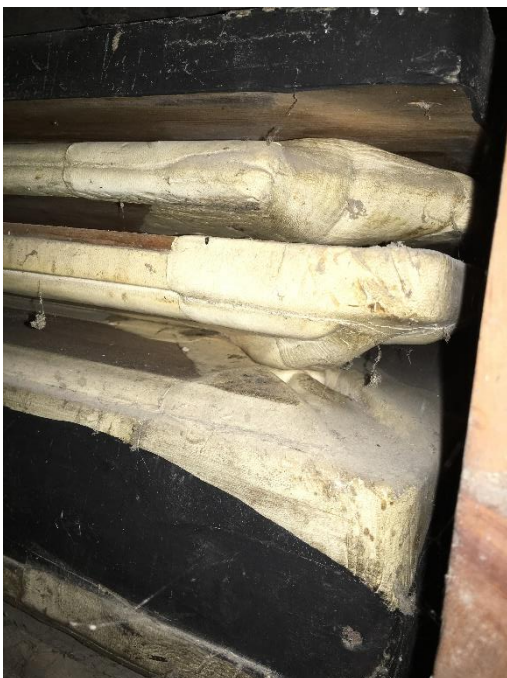
Far left: later gusset leather to the inverted fold (top) and the middle gusset