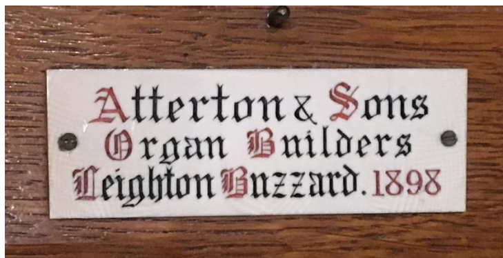
Case and name plate

Below: front of organ with panelling removed, and pallet box cover, showing pallets, green plastic eye inserts from 1985, etc. The white strip on the front of the soundboard is the masking tape. The pallets are faced with two layers of thick leather. The surface of the soundboard under the pallets is clean, as if it was planed flat in 1985