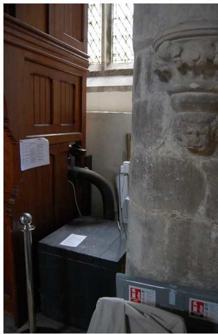
Left: blower box, kopex trunk